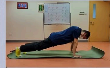
Incorrect Isometric Push-Up position: